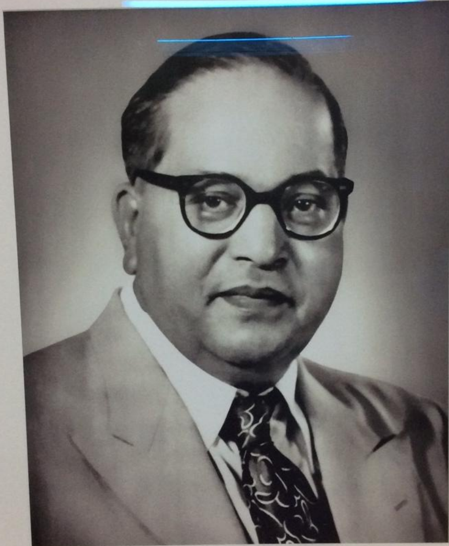
The Chief Architect of Constitution of India