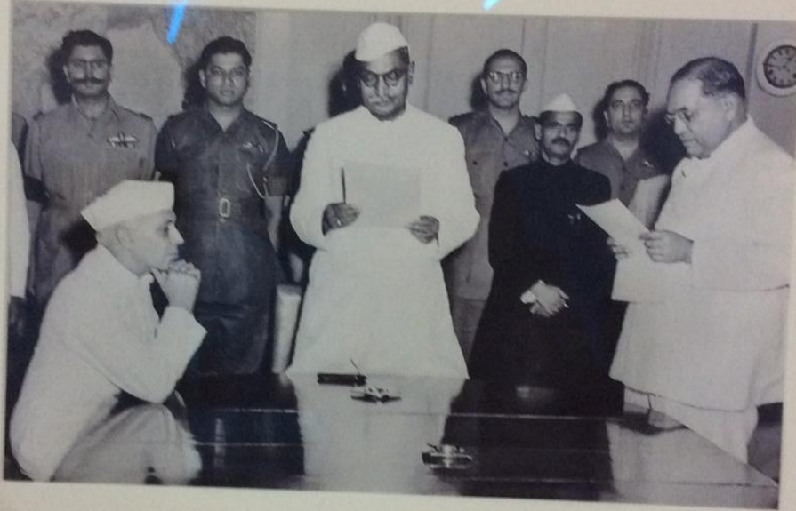
Dr. Ambedkar being sworn in as Minister of Law and Justice by President Rajendra Prasad in Rashtrapati Bhavan. Also seen is Pandit Nehru, the first Prime Minister of India 8th May 1950